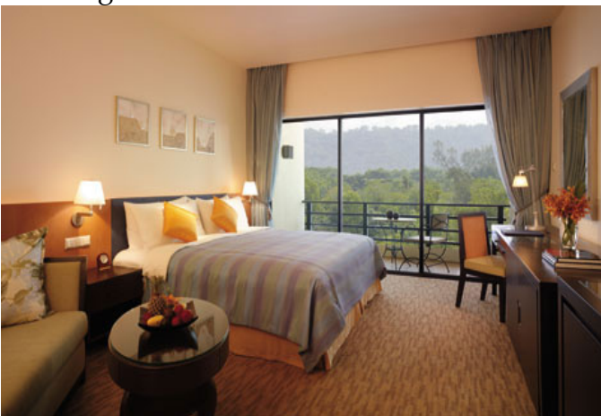
Shangri-La's Tanjung Aru Resort - Mountain View/Seaview