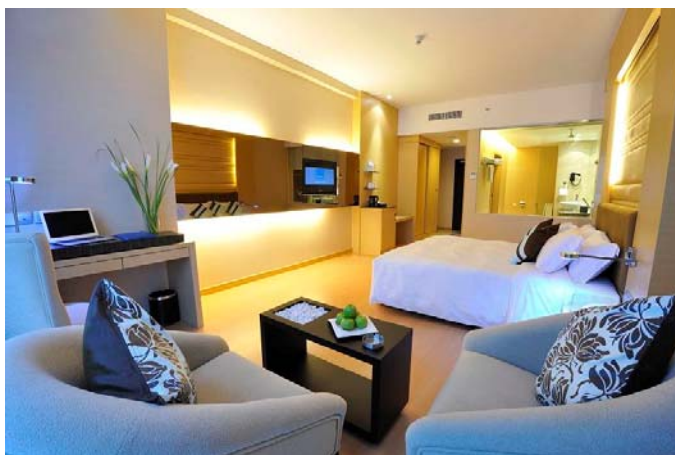
Novotel 1 Borneo Standard King