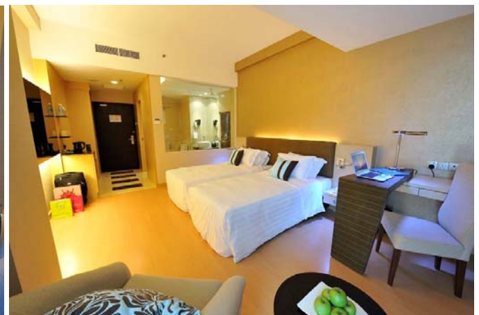
Novotel 1 Borneo Standard Twin