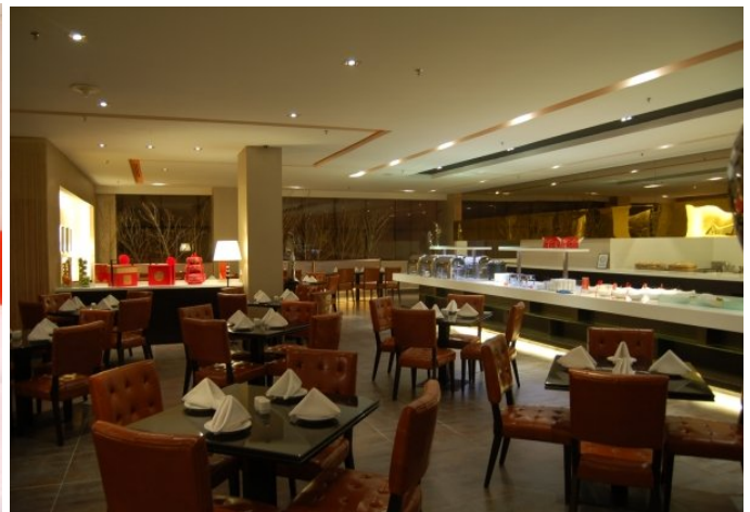
The Palace Hotel - Brand new Restaurant