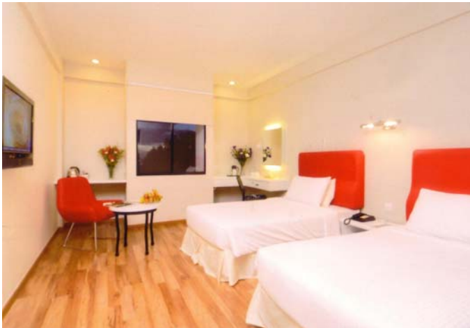
The Palace Hotel - Superior Twin/King

Deluxe Seaview - $78.00 per room per night