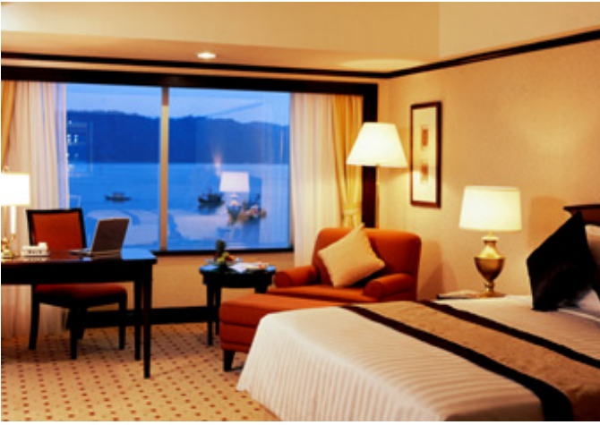
Le Meridien Deluxe ROH