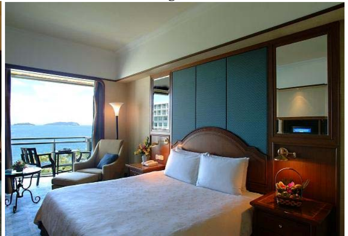
The Pacific Sutera Deluxe Sea View