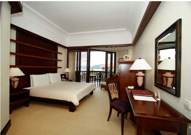
The Magellan Sutera Deluxe Sea View