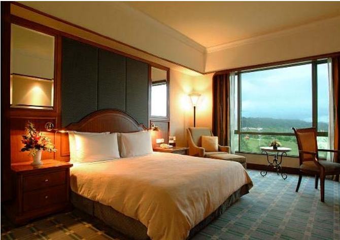
The Pacific Sutera Deluxe Golf View