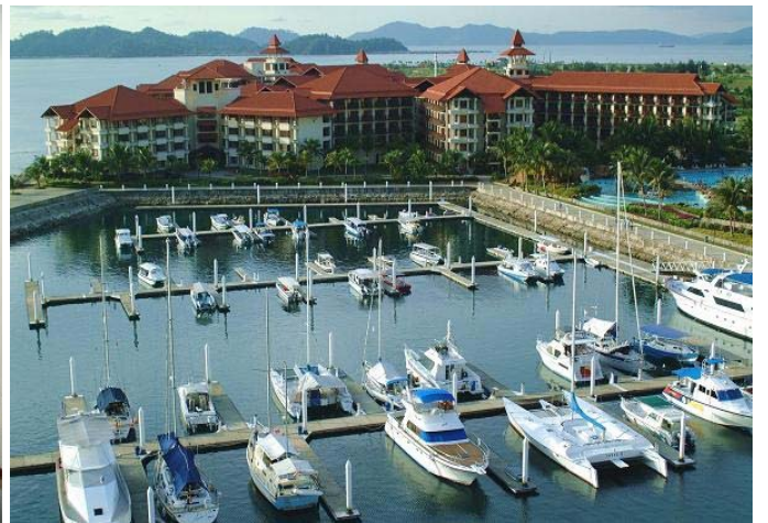
Sutera Harbour - Marina